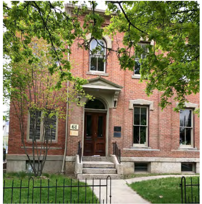
61 Jefferson Avenue with a restored historic brick exterior that highlights the handsome original stone lintels