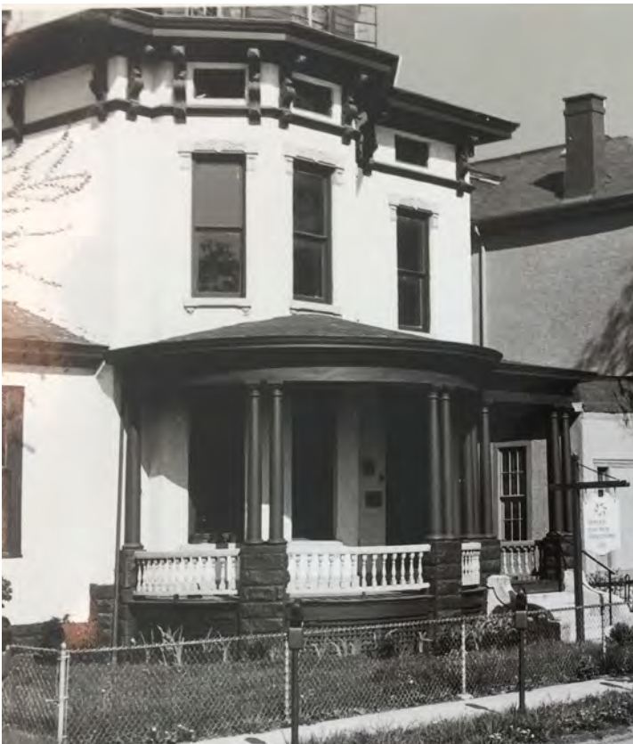
51 Jefferson Avenue, built in 1880 and covered in stucco at some unfortunate later date