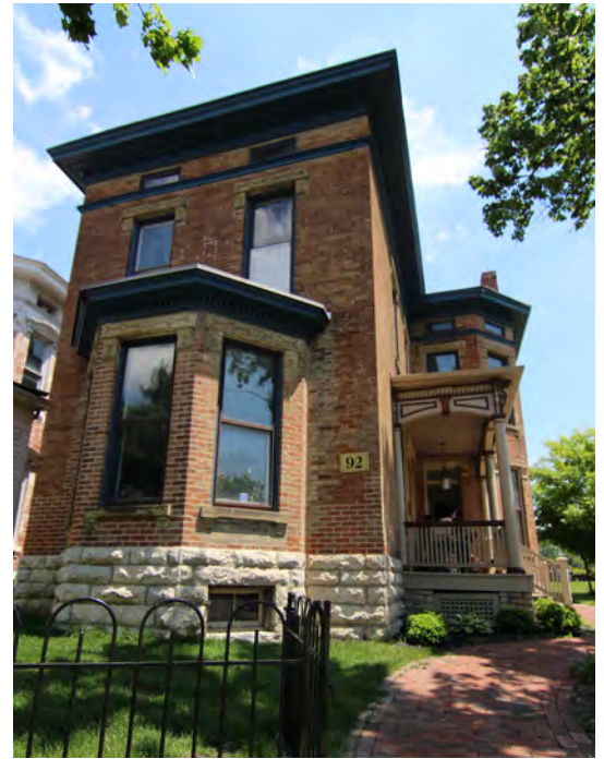
92 Jefferson Avenue with a restoration that brought back the distinctive bay windows