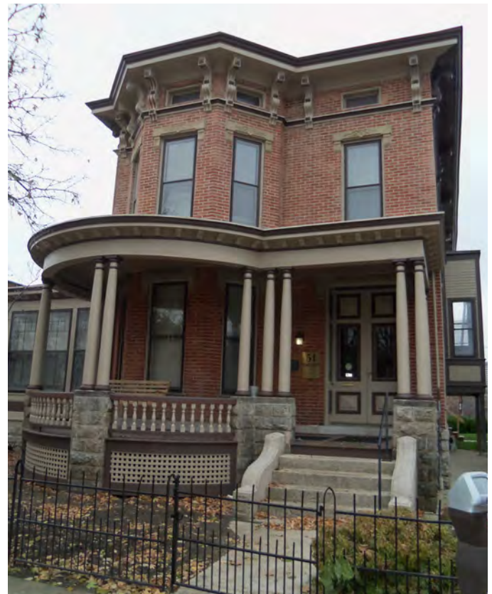
51 Jefferson Avenue with a restored historic brick exterior and a porch swing for coffee breaks

Renovating a deteriorated (condemned in several cases) building is not for the faint of heart. Our architects, builders, board members, and staff have been