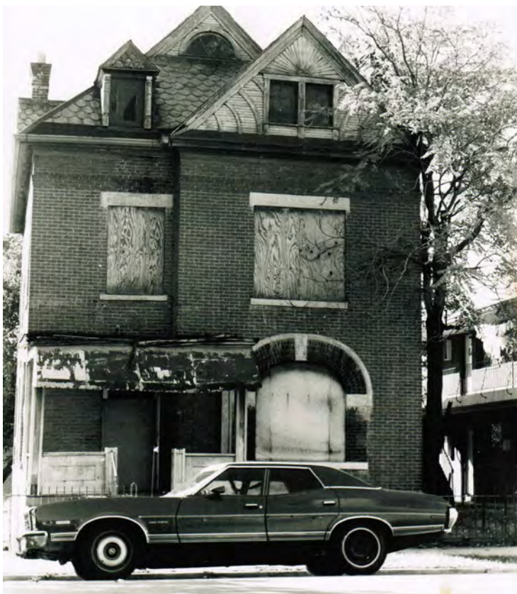
77 Jefferson Avenue, condemned by the City of Columbus, acquired in 1975