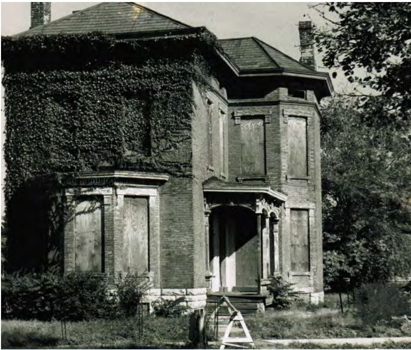
92 Jefferson Avenue, condemned by the City of Columbus, acquired 1975