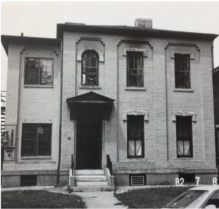
61 Jefferson Avenue, acquired in 1975 with painted brick and an operating barbershop in the basement